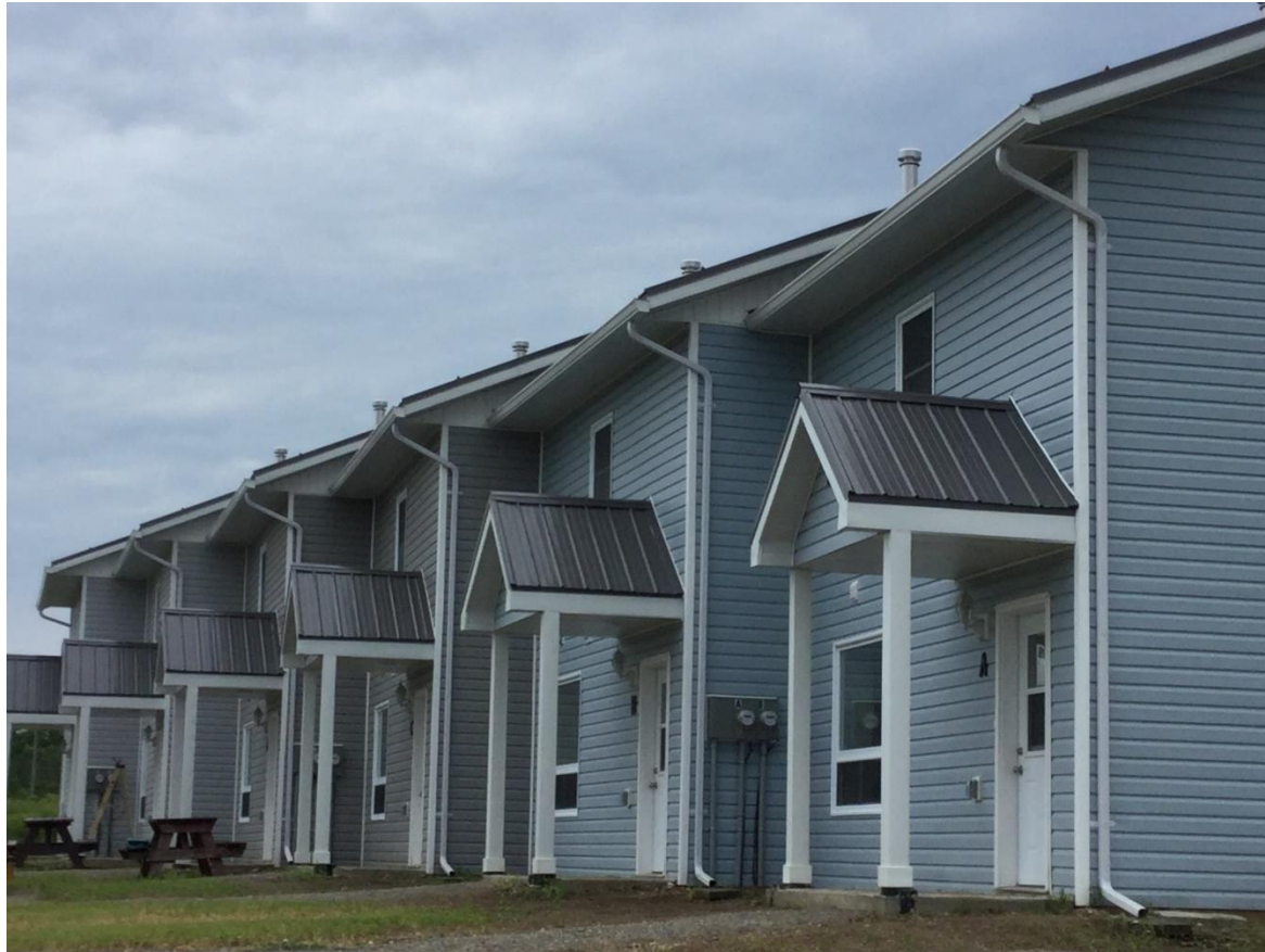
Six Plex – completed July 2017