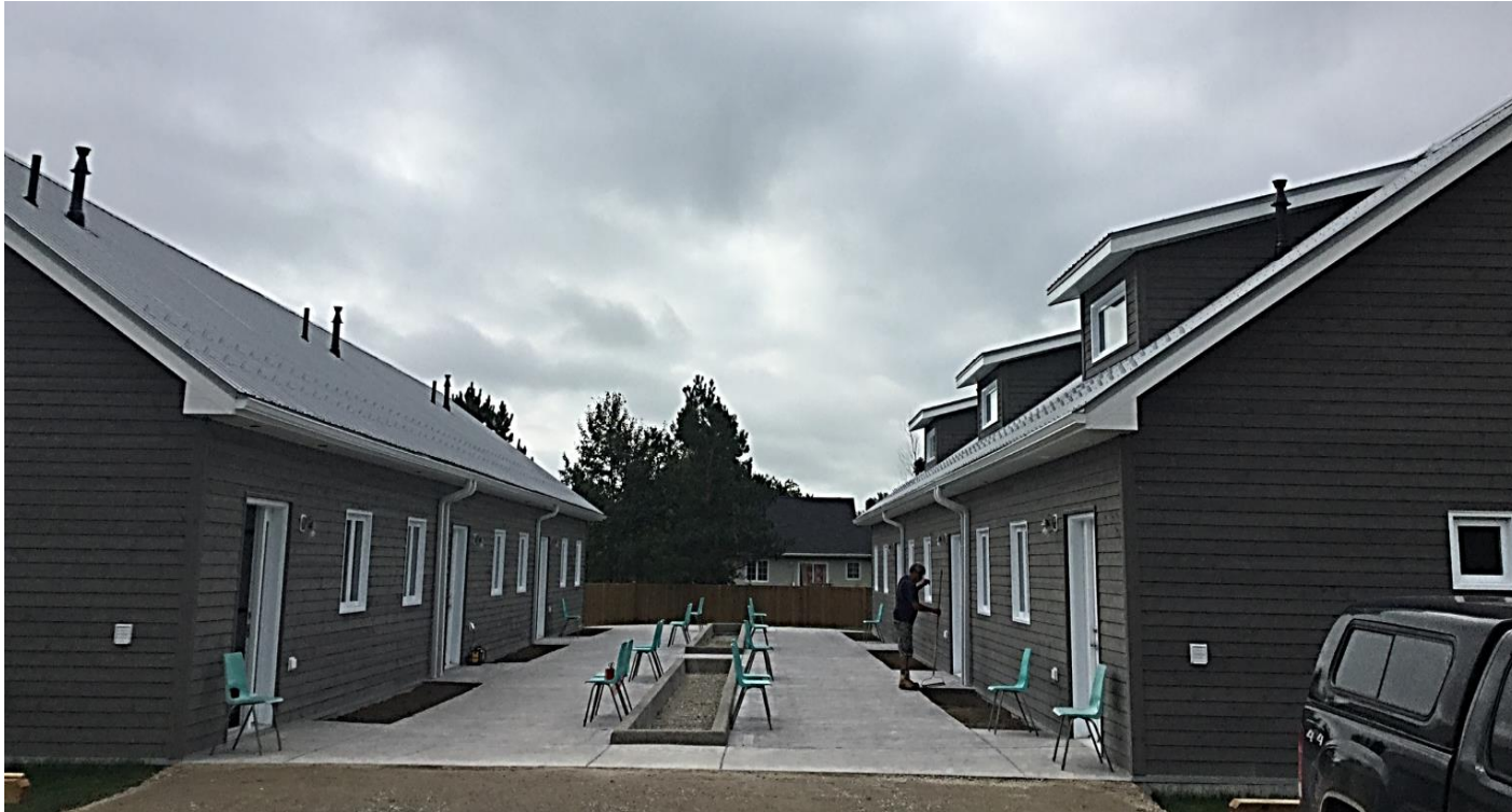
Two tri-plexes – completed September 2018