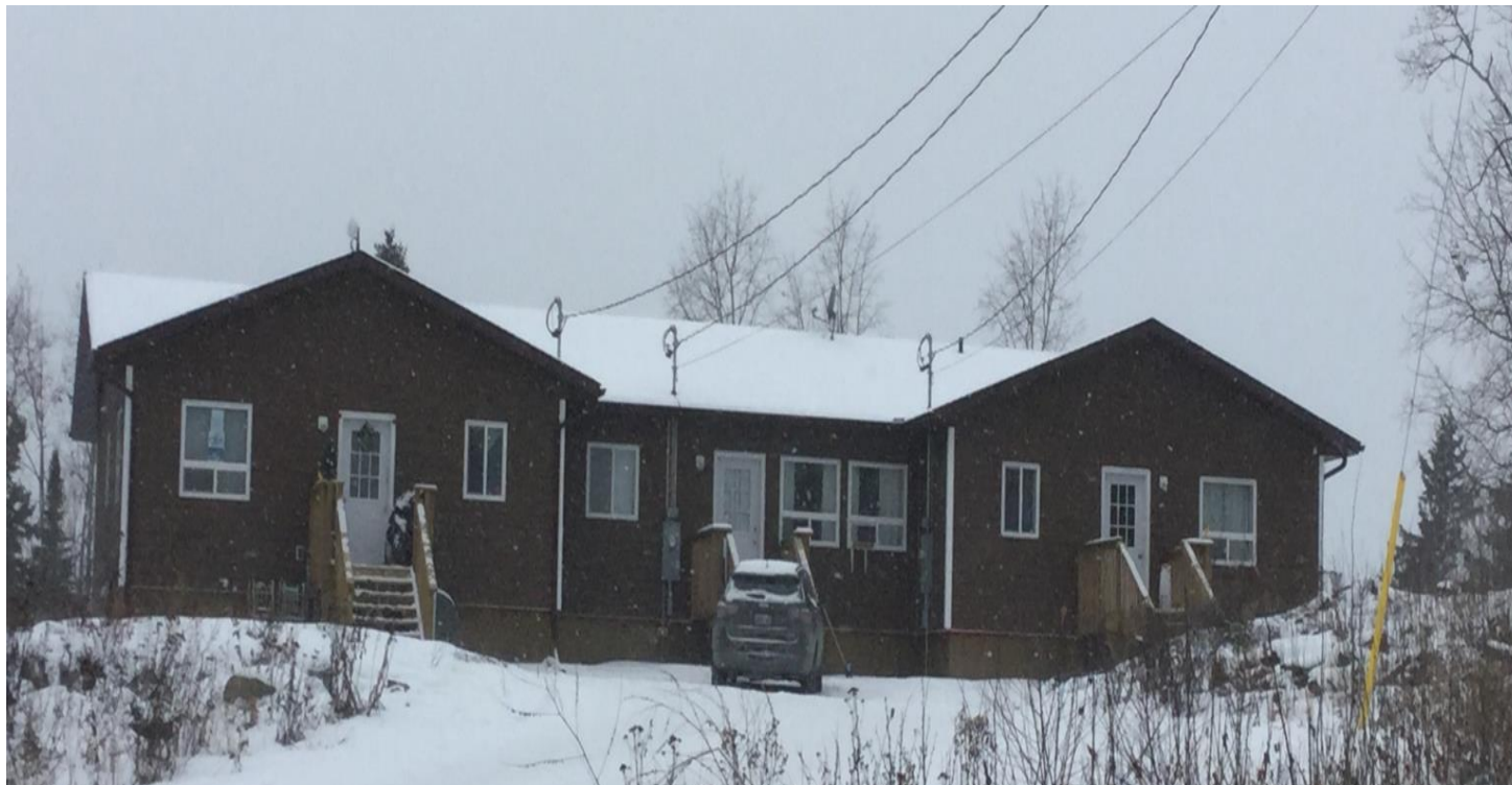
Two tri-plexes – completed December 2018