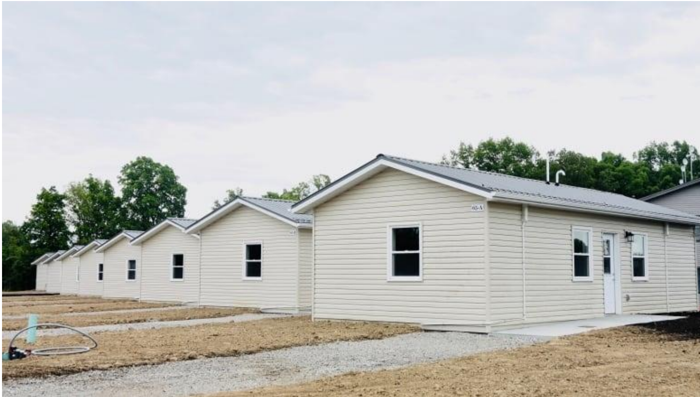
Eight Tiny Homes – completed August 2020